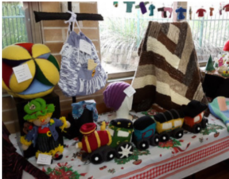
Selection of members' works